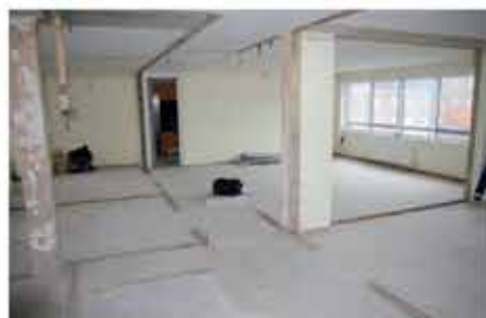
Figure 2: Shell after demolition of internal partitions