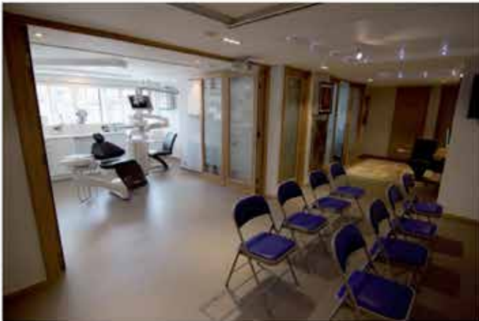
Figure 11: Glazed screen to treatment room one open for lectures