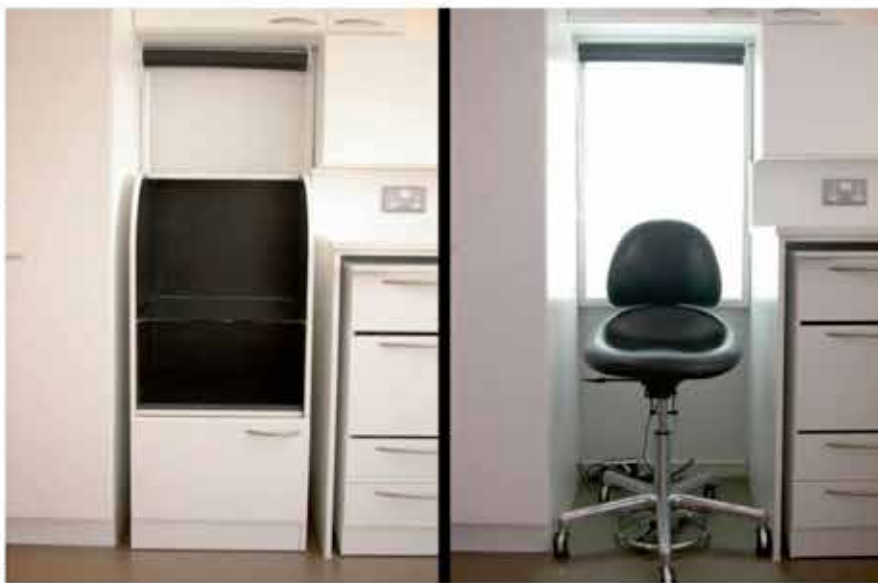
Figure 14: Mobile photographic cabinet and photo booth