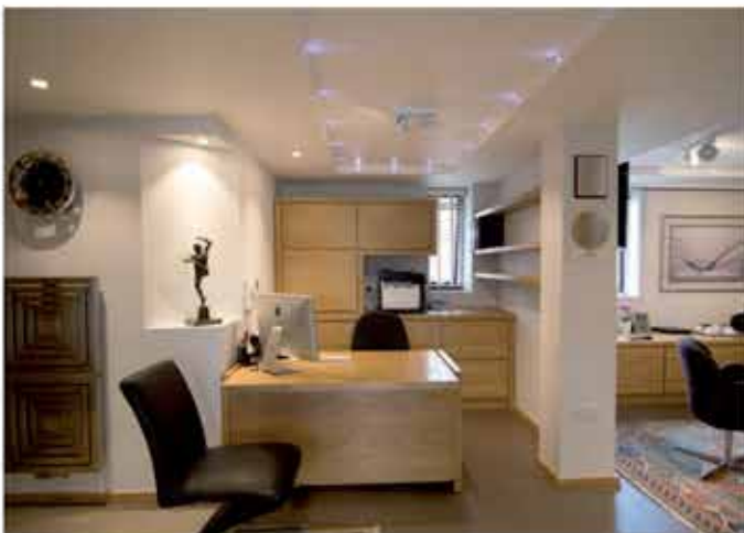
Figure 5: Reception

The Planmeca Sovereign dental chair has an extremely versatile movement range, with a double rotating base. This allows for optimal chair positioning for use of a microscope and access for dentists observing live patient treatment. The chair is electronically operated, which allows for optimal control of the electric micro-motors and speed-increasing hand pieces that Basil uses routinely.