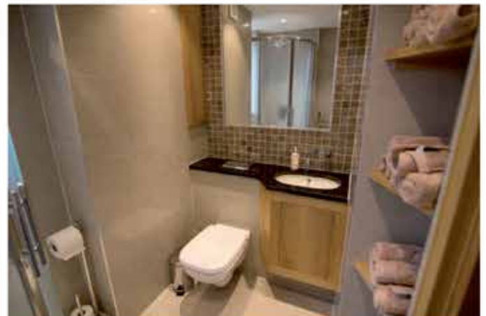
Figure 10: Bathroom