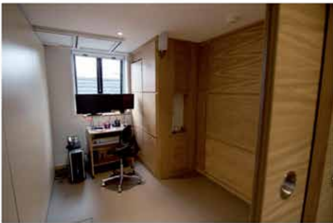
Figure 9: Office with folding wall and oak sliding doors