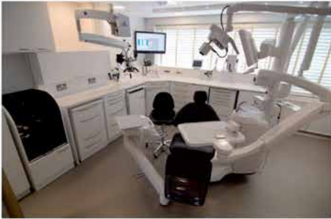
Figure 7: Treatment room one