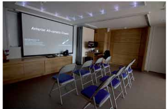
Figure 12: Folding wall and sliding doors open for lectures

The dental cabinetry is elaborate and customised to Basil's exacting specifications, which took many conference calls between him, the design team, and his highly experienced dental nurse, Sandra Seeram. These calls allowed the design of the cabinetry to be modified immediately on screen in front of all parties.