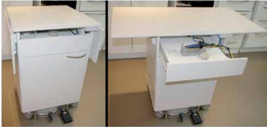
Figure 13: Custom trimming bench