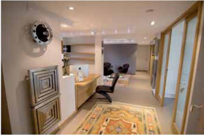
Figure 3: Reception and entrance to treatment room two