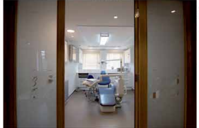
Figure 8: Treatment room two through glazed screen