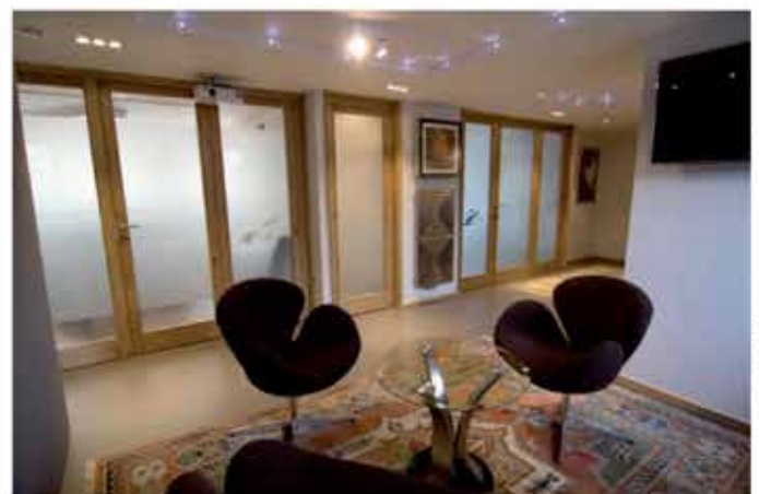
Figure 6: Waiting area and oak glazed screens of treatment rooms and decontamination room