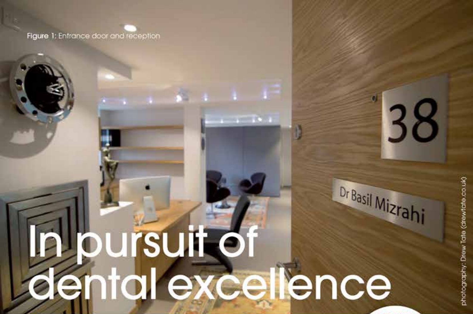
Figure 1: Entrance door and reception